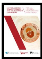
Victorian Early Years Learning and Development Framework

Approved learning framework: a guide which provides a vision for learning, pedagogical principles, practices and general goals or outcomes for children’s learning and how they might be attained. It provides a scaffold to assist educators to develop their own, more detailed curriculum relevant to their setting and the children and families attending. The Early Years Learning Framework V2 (Belonging, Being & Becoming) , the Victorian Early Years Learning and Development Framework and My Time, Our Place V2; Framework for School Age Care in Australia are approved learning frameworks for use in Victoria ( refer to Sources ).