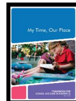
My Time, Our Place; Framework for School Age Care in Australia 2022 V2

Critical reflection: is a meaning-making process that assists informing future practice in ways that demonstrate an understanding of each child’s learning, development and wellbeing and implications for equity and social justice. It involves examining and analysing events, experiences and practices from a range of perspectives to inform future planning and decision-making ( Early Years Learning Framework 2022 V2 – refer to Sources ).